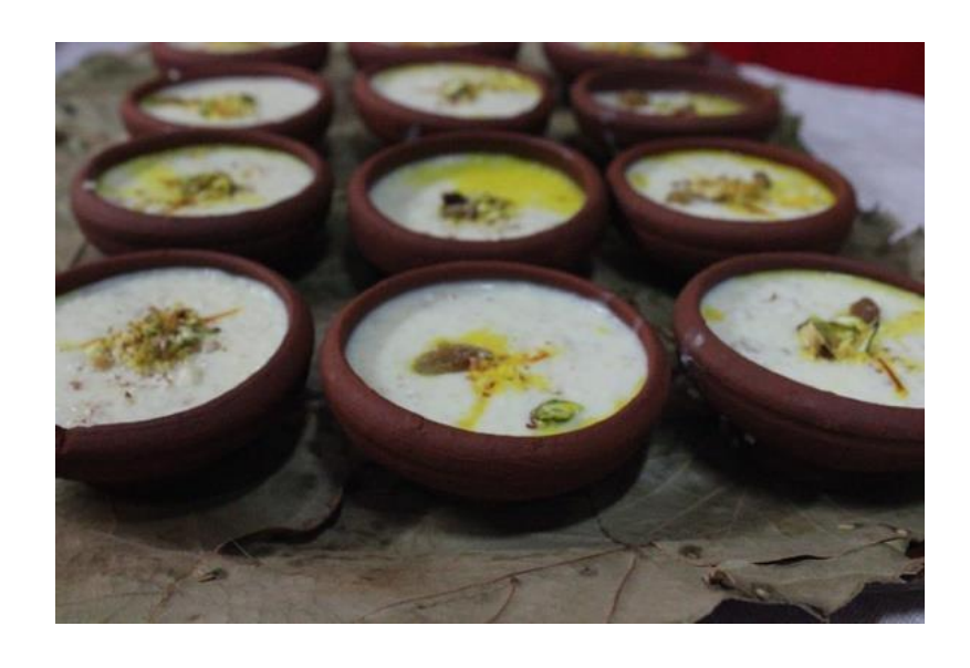
Jhangore ki Kheer